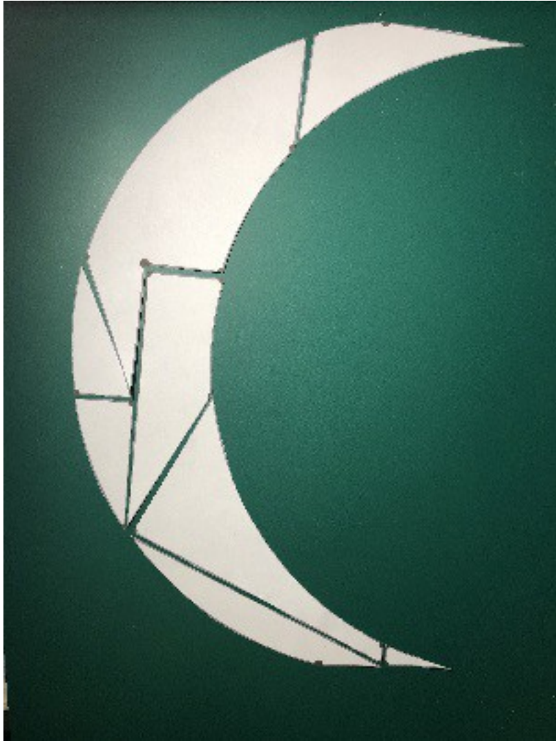
Jour 11 (2)